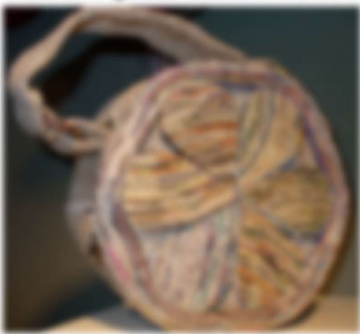
Left: recycled newspaper handbag from Green Veranda . Right: two of the many patterns available from the One Sole Interchangeable Shoes .