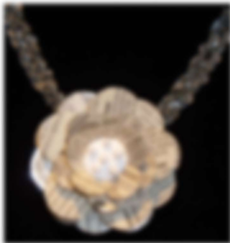
A recycled newspaper flower necklace from Green Veranda .