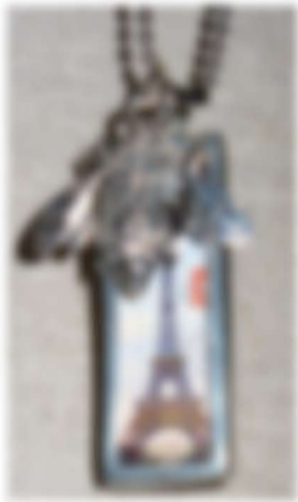
Pick Up Sticks double-sided photo jewelry.