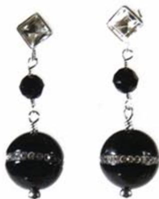
earrings: matching black onyx balls, cubic zirconia accents, white topaz posts

"If you don't travel you are missing out, I think it is a really important part of being alive, you need to see your planet, and envelope yourself in other cultures and see what goes on elsewhere. You learn so much, and truly come back improved."