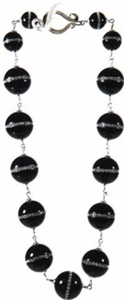
necklace: black onyx balls, cubic zirconia accents around the middle